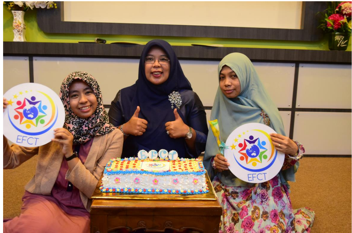
Indonesia, Community Teacher, 2017