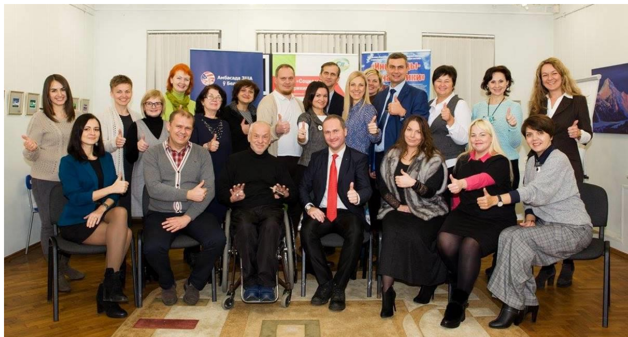
Belarus, Social Project, 2017

The winners of the 2018 Alumni Engagement Innovation Fund will be announced in August, after all teams have completed all required grant documentation.