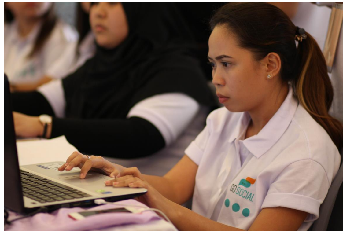
Philippines, Go Social, 2017

The Alumni Engagement Innovation Fund (AEIF) competition provides small grants – up to $25,000 – to teams of past and current participants of U.S. government-sponsored exchange programs to carry out public service projects that utilize skills and knowledge they have gained through their exchange experiences.